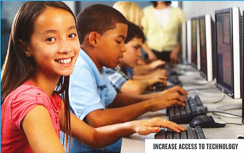
INCREASE ACCESS TO TECHNOLOGY