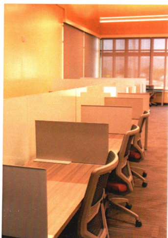
Student study area