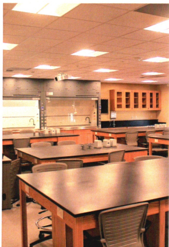
Wet science laboratory